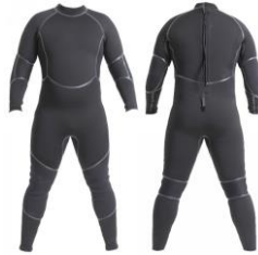
3mm Military Wetsuit